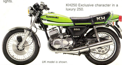
UK model is shown.

KH250 Exclusive character in a luxury 250.